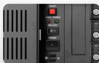
Power/ Reset button HDD LED Indicators 2x USB 2.0