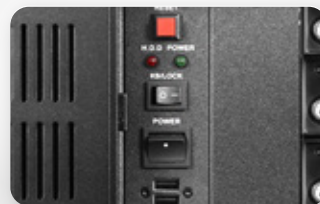
Power/ Reset button HDD LED Indicators 2x USB 2.0