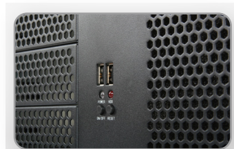
2 x USB 2.0 Power + HDD LED Indicators power + Reset switch