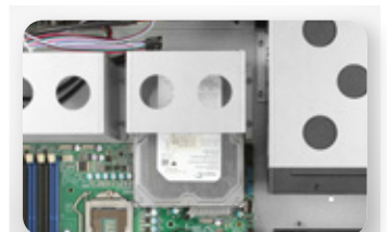
Fits 3.5" HDD