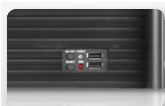
Power button HDD LED Indicators 2x USB 2.0